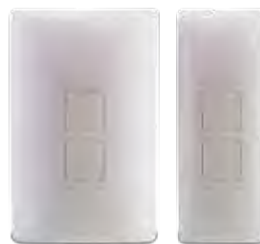
Smart Battery-Powered Wall Switch

GoControl Z-Wave products are Z-Wave certified, and allow dealers to create an integrated wireless network with nearly limitless expansion and interoperability with security, energy management, home entertainment, appliances, and more.